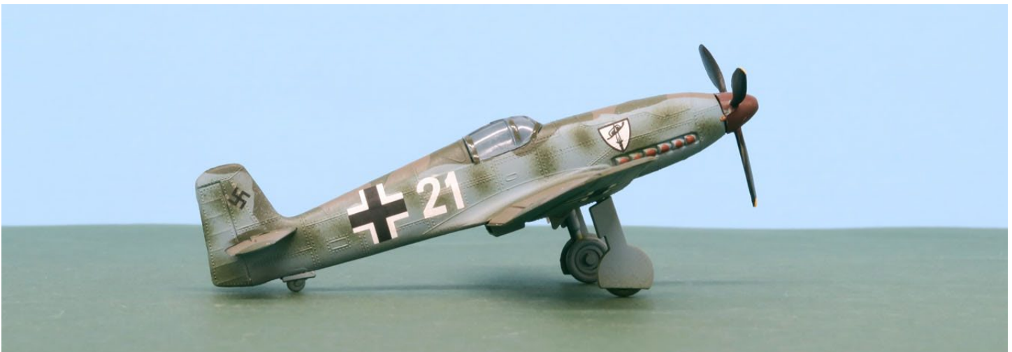
Frank Moore's 1:72-ish scale Heinkel He 100 D (Lindberg), built OOB and painted with Tamiya acrylics. Decals are from the kit. Although the He 100 was one of the fastest (it briefly held the world speed record of 463 mph in 1939) and most advanced fighters of its time, the type was not ordered into production by the RLM for reasons that remain obscure to this day.