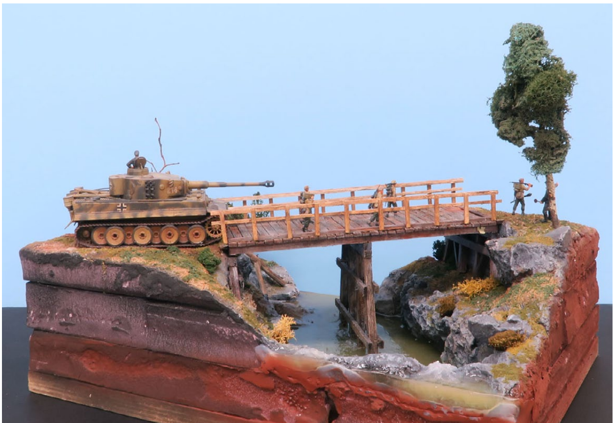
Jim Brao's 1:35 scale small diorama of a Tiger I and personnel making a river crossing. The tank model is from Tamiya and was built OOB. This was Jim's first foray into building dioramas and involved a number of new (to him) techniques including water effects, the scratchbuilt wooden bridge, and rock castings from plaster. Jim adds that the idea for the scene came from an actual photograph.