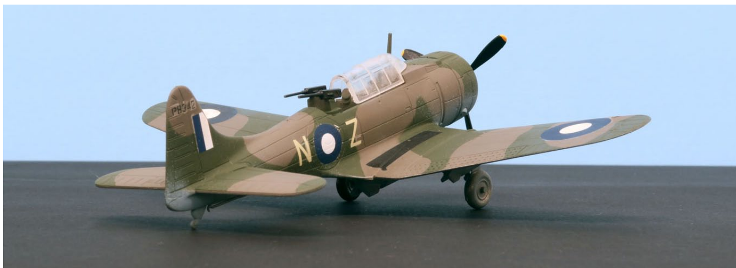
Frank Moore's 1:72 scale SBD-4 Dauntless (Hawk), built OOB and painted with Tamiya acrylics. Markings, from Aeroscale, are for the Royal New Zealand Air Force, which received 41 SBD-4s and -5s and used them successfully in combat over the Pacific.