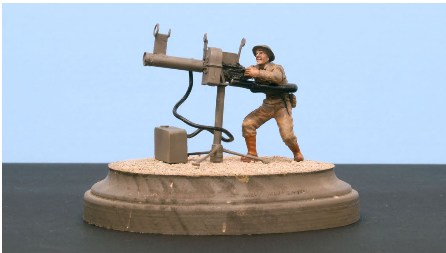
Frank Moore's 1:35 scale 50-cal. machine gun (Tamiya). Frank converted it to water-cooled configuration. Paints are Tamiya.