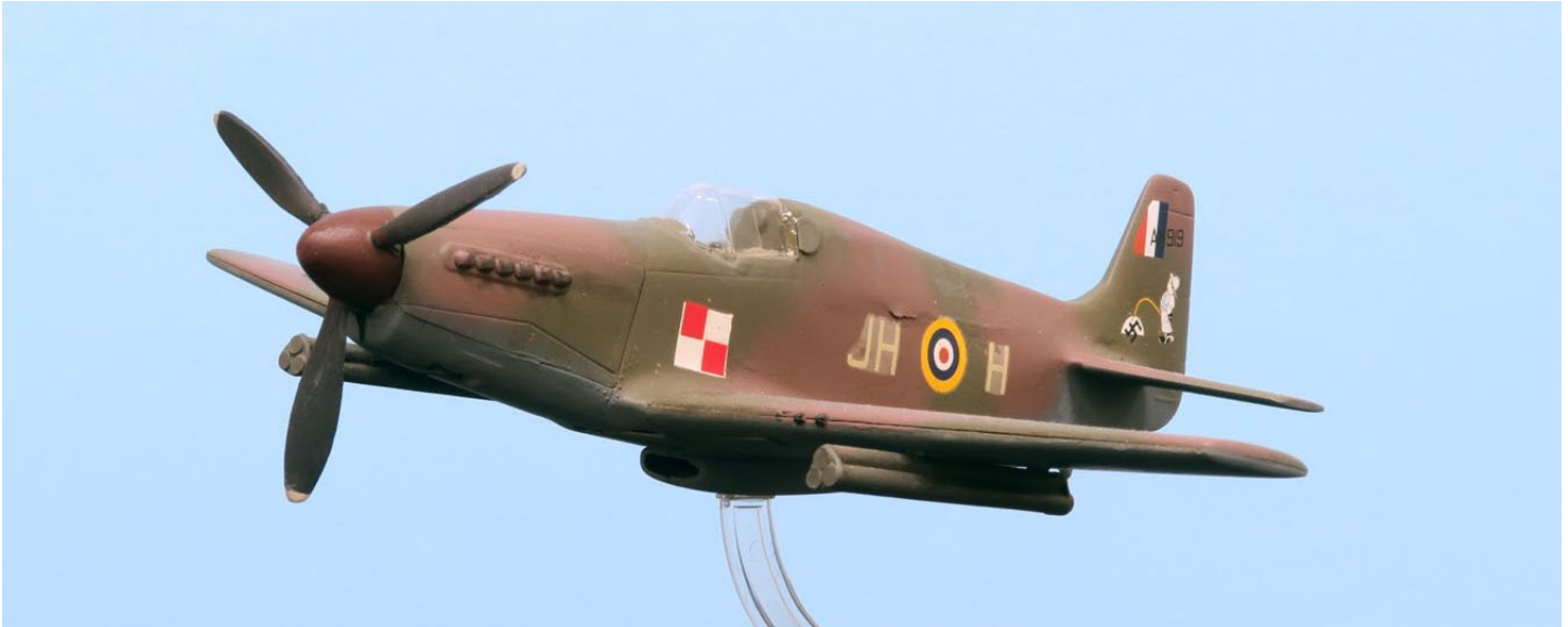
Frank Moore's 1:48 scale Mustang III. Frank converted it from an Aurora P-51D by adding the raised rear fuselage spine and replacing the bubble canopy with a British-developed Malcolm canopy. Paints are Tamiya acrylics. Markings are fictitious.