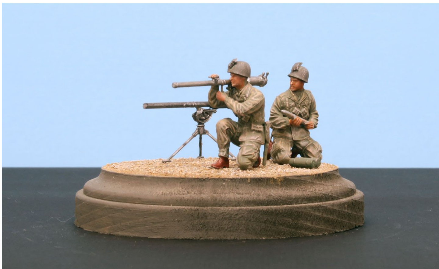
Frank Moore's 1:35 scale recoilless rifle (bazooka) and crew, and tripod-mount 50-cal. machine gun, all from Tamiya.